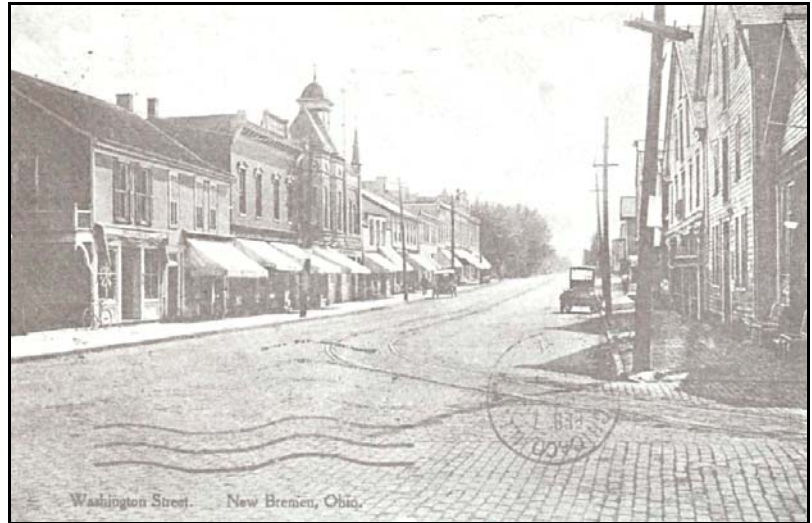
WASHINGTON STREET – NEW BREMEN, OHIO - 1923