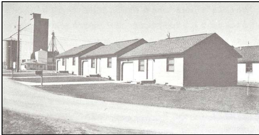
A 1990 LOCATION PICTURE.

THERE WAS MUSIC DURING THE DAY AND MANY KINDS OF GAMES FOR YOUNG AND OLD. WHEN THE SUN STARTED TO SINK IN THE WEST, THE FARMERS KNEW IT WAS TIME TO FEED THE LIVESTOCK AND MILK THE COWS. IT WAS TIME TO WEND THEIR WAY HOME. IT WAS THE END OF A PERFECT DAY! (ML)