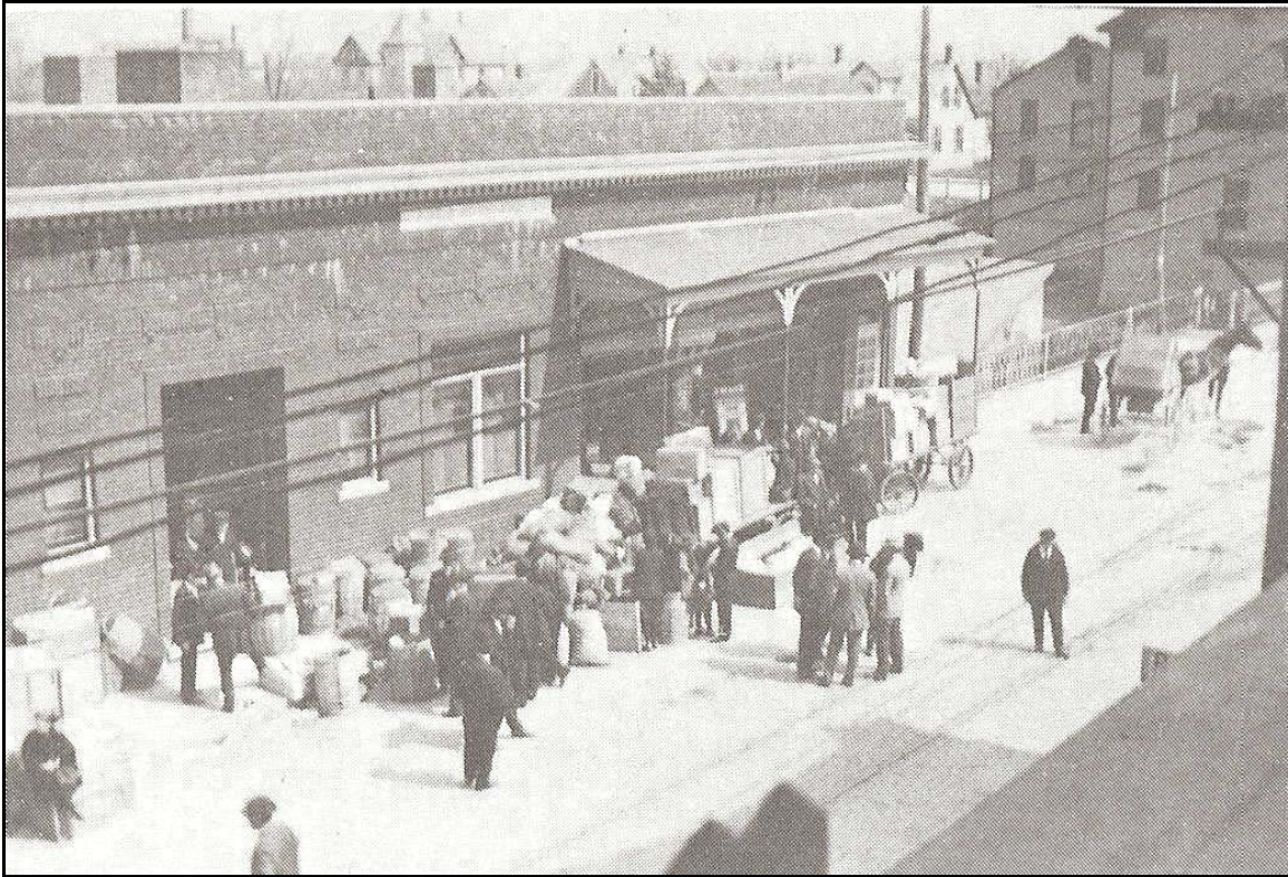
MONROE STREET IN THE EARLY 1900s

THE CANAL FLOWS LAZILY THROUGH THE LITTLE VILLAGE OF NEW BREMEN. MERCHANTS ARE OPENING THEIR STORES, ADJUSTING THE AWNINGS, PEERING AT THE SKY, WONDERING WHAT THE WEATHER WILL BE. ONE CAN HEAR THE SOUND OF THE HORSES' HOOVES CLATTERING ON THE BRICK ROADS MAKING THEIR WAY THROUGH THE AWAKENING TOWN, DELIVERING MEAT AND MILK FOR THE DAY.